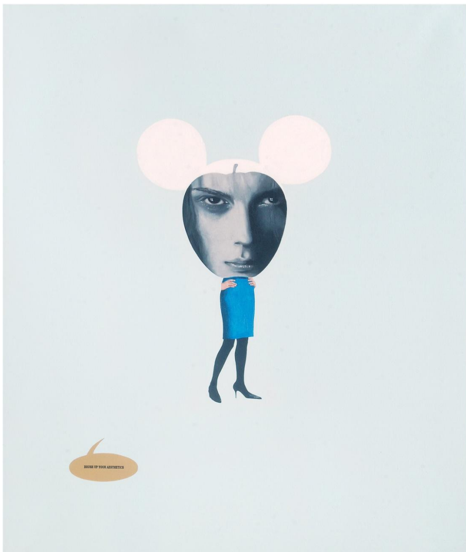
Brush up your aesthetic Oil, acrylic & serigraphy on canvas 36" x 30" (91 x 76 cms) Rs.1,75,000/-