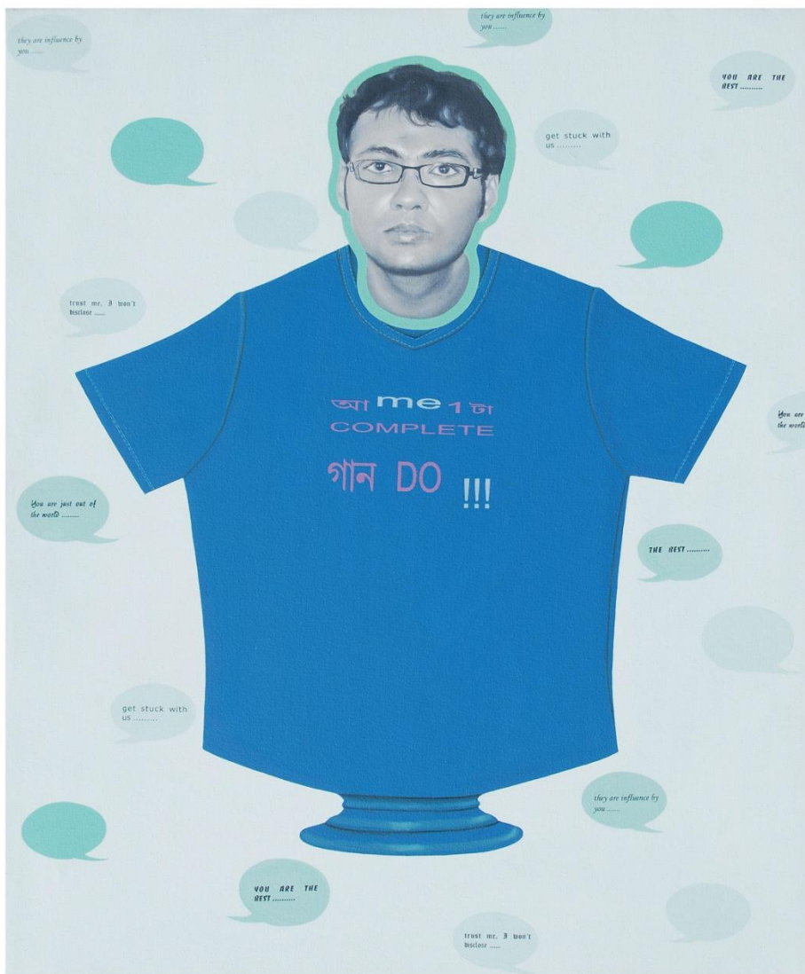
The Gandu (Bengali slang) Oil, acrylic & serigraphy On canvas 36" x 30" (91 x 76 cms) Rs. 1,75,000/-