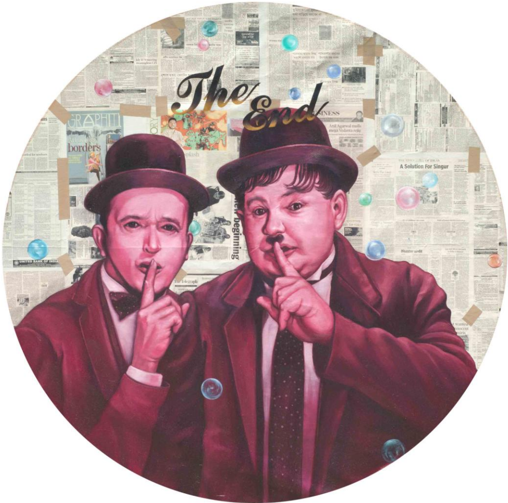
The End Mixed media on canvas 66" dia (168 cms) Rs.3,50,000/-